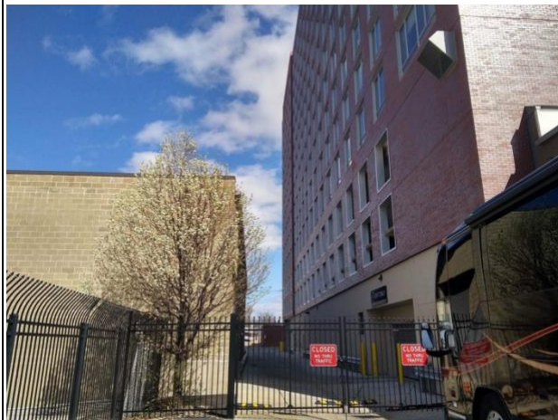
Pull all the way forward to the gate!