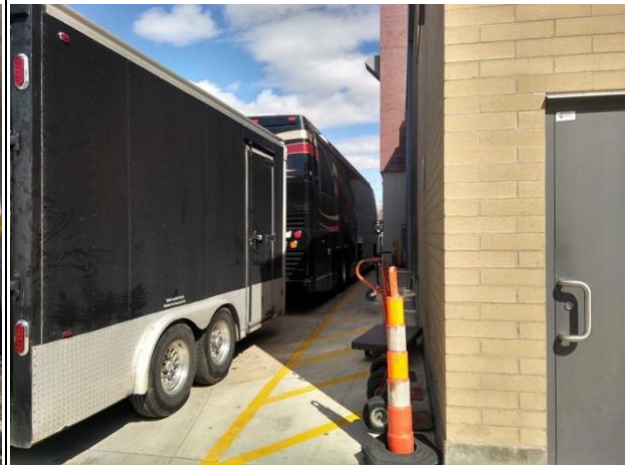
Single buses park on the right, staying clear of the yellow lines.