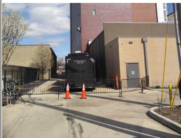
Single bus parked at rear of building, with load in door pictured on the right.