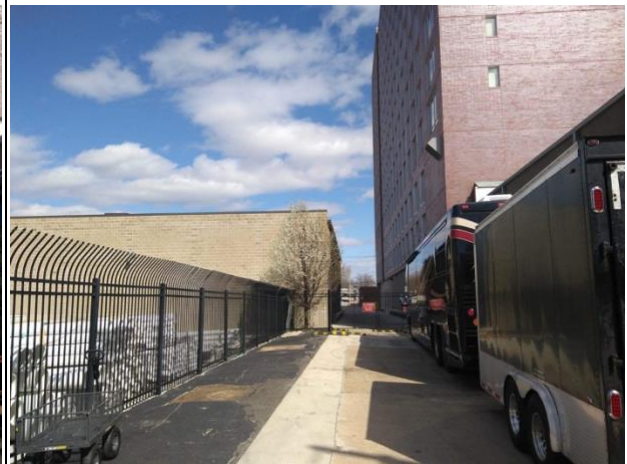
Parking for second bus or van(s) to the left.