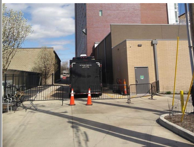
Single bus parked at rear of building, with load in door pictured on the right.