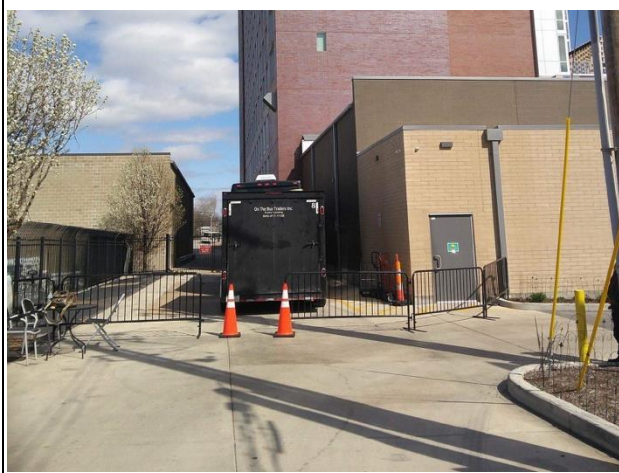
Single bus parked at rear of building, with load in door pictured on the right.