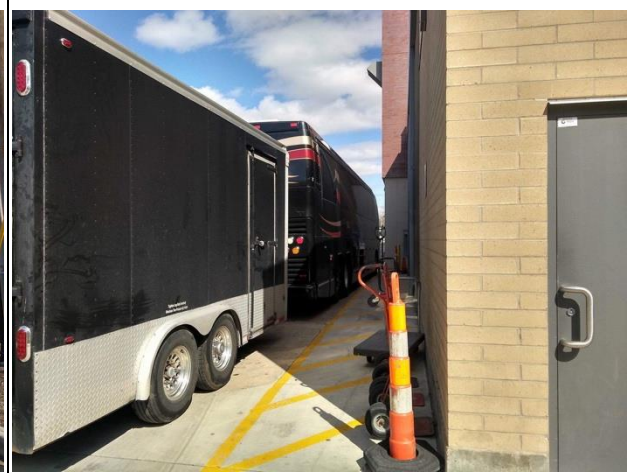
Single buses park on the right, staying clear of the yellow lines.